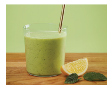
Honeydew, Apple and Avocado Smoothie