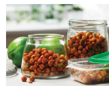
Crispy Chickpeas and Pumpkin Seeds with Lime