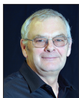
Jack Ford Box 250 Wishart, SK S0A 4R0